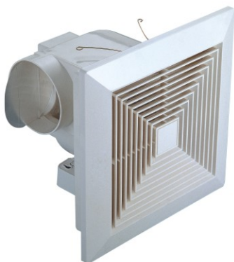
TUB715 TUB716 TUB915 TUB916