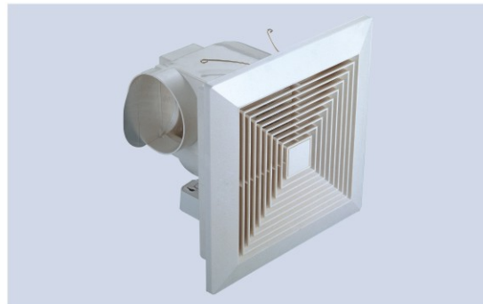
TUB715 TUB716 TUB915 TUB916