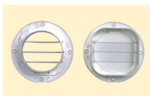
BACK DRAFT SHUTTER