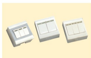
WATER PROOF SWITCH