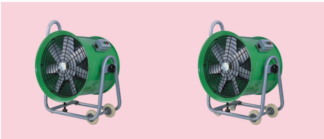
CAD6-40F2 , CAD6-50F2