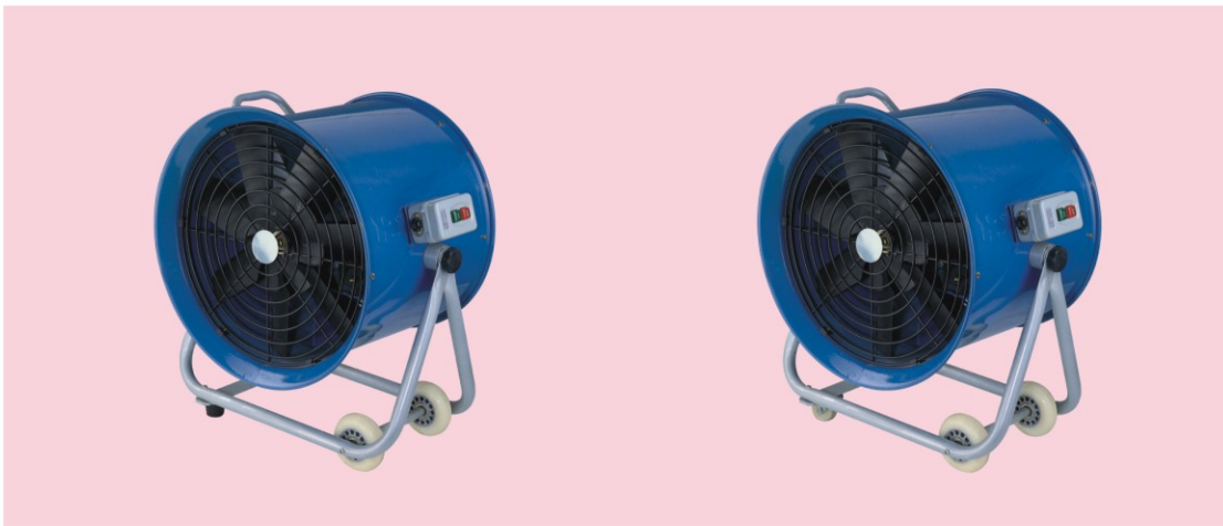
CAD6-40F1 , CAD6-50F1