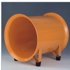
DURABLE CASING ● rolled sheet steel with epoxy paint finish