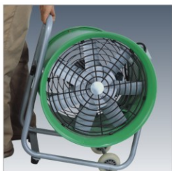
EASY-TO-MOVE HANDLE AND WHEELS