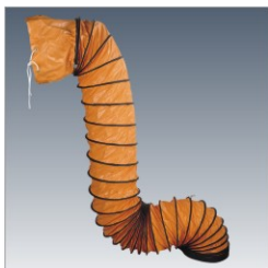
OPTIONAL FLEXIBLE DUCT ● PVC fire retardant with operation temperature 150°C ● extended length to 10m, 15m, by connecting 5m/unit ducts