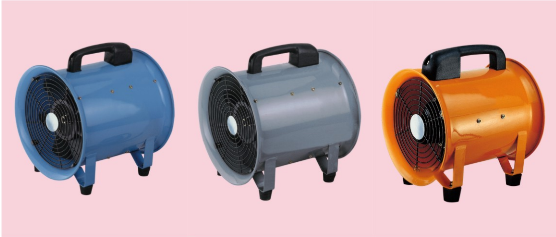
CAD2-20, CAD2-25, CAD2-30