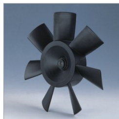
IMPELLERS ● die-cast aluminum