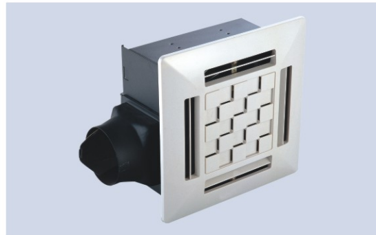
TUB25 PLASTIC SIROCCO FAN VANE