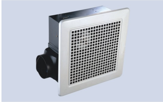
TUB215 FULL METAL