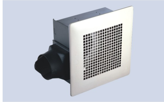
TUB18M FULL METAL